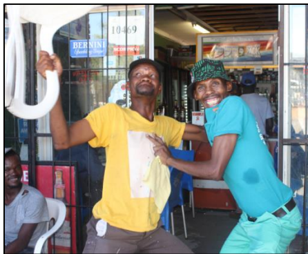
Happy Uncle Benny's Restaurant clients!

For more information on this article, contact: